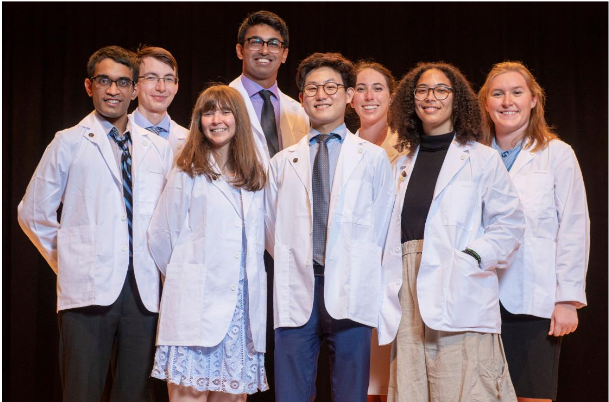
Matriculated class for Fall 2021 at the annual White Coat Ceremony, August 13, 2021